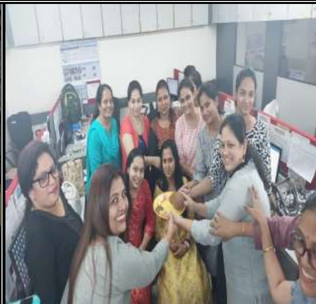
BABY SHOWER AND PRE WEDDING-LUNCH